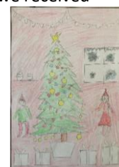
Tilly R 3JW